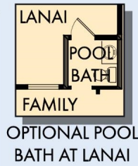
OPTIONAL POOL BATH AT LANAI