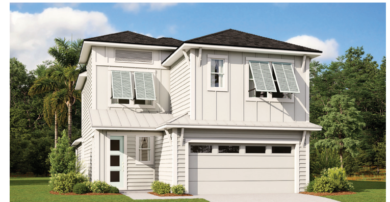
MODERN COASTAL ELEVATION #3