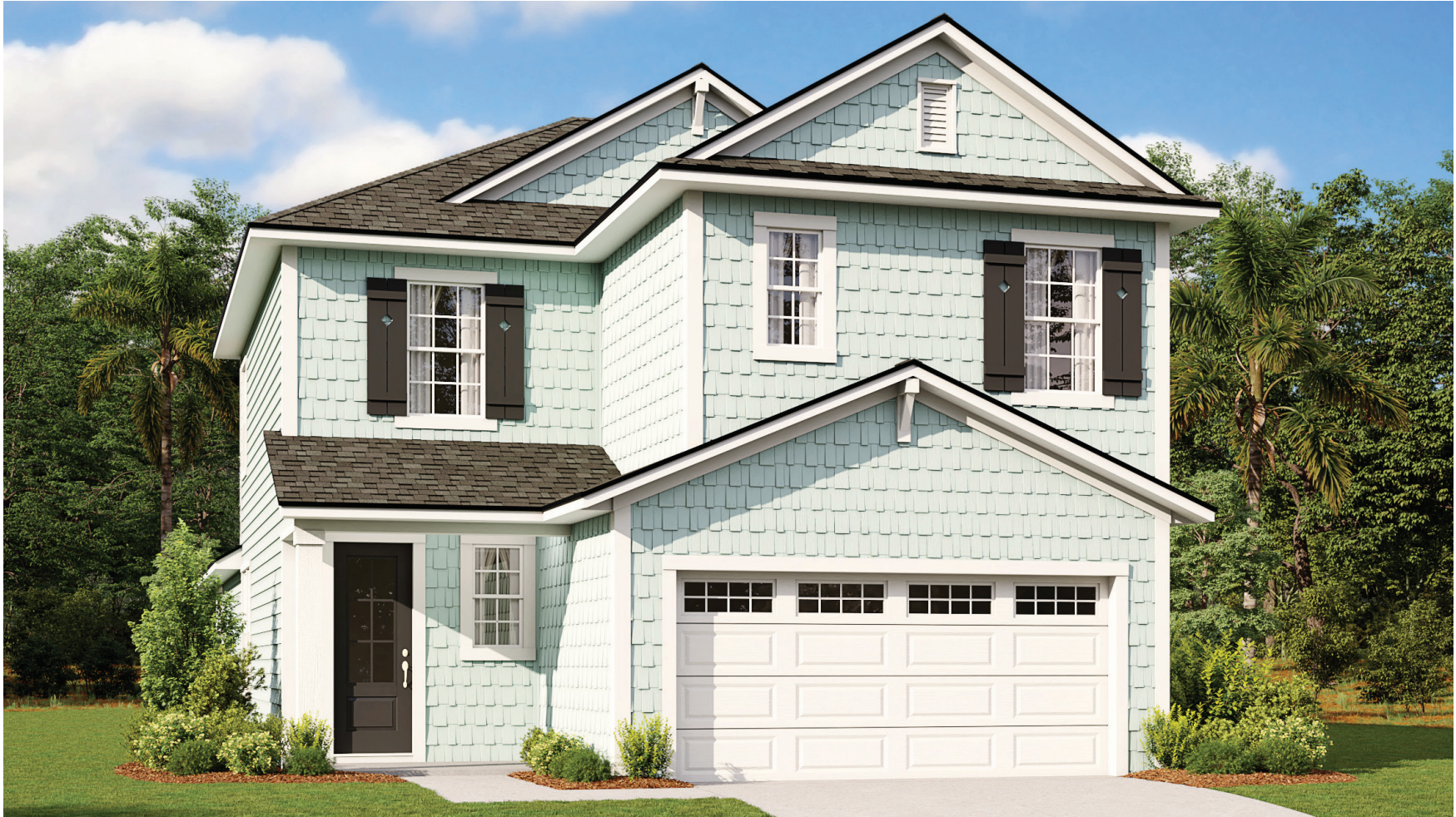
CAPE COD ELEVATION #7