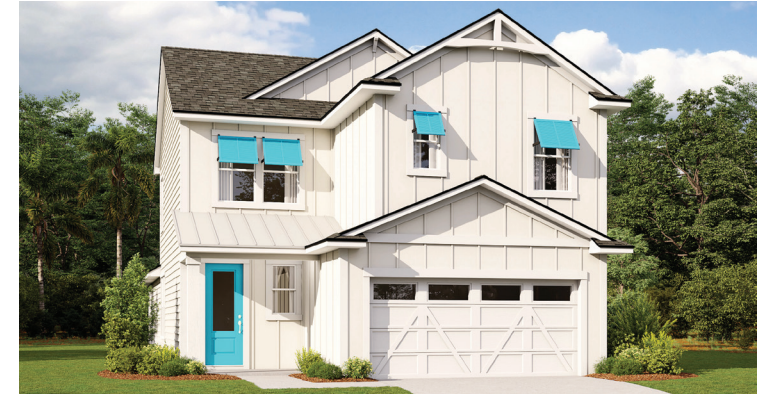
CARIBBEAN ELEVATION #5