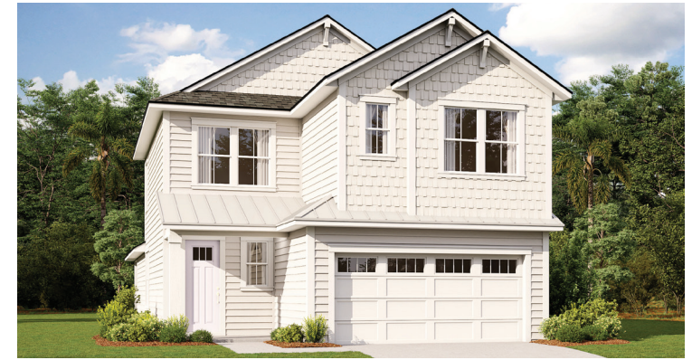
KEY WEST ELEVATION #2

4 BEDROOMS, 2 ½ BATHS, LOFT, AND 2-CAR GARAGE LIVING AREA: 2,398 SQ. FT.