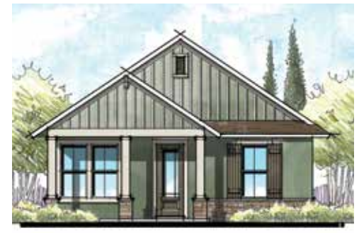
The Pastoral Cottage Elevation (Color Scheme 4)