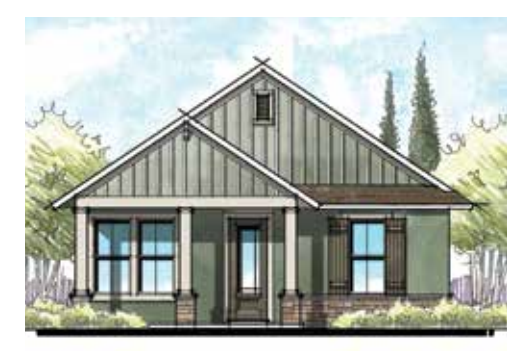
The Prairie Cottage Elevation (Color Scheme 4)

The Caribbean Cottage Elevation (Color Scheme 2)